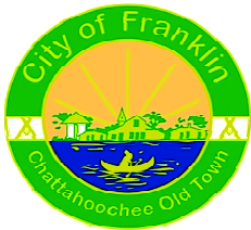
City of Franklin